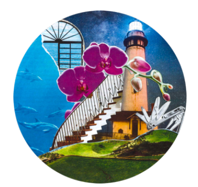
Fig. 1: Hope collage, full colour

In this workshop, I walked students through the process of selecting images that resonated (or not) with them in response to the big question posed for each collage. I also modelled techniques for cutting, layering, and gluing images down on the circle templates provided for each collage. In order to flatten the seams between images in each collage, we scanned the finished hope collages in colour (Figure 1) and the finished doubt collages in black and white (Figure 2).