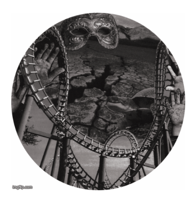
Fig. 5: Ever unfinished GIF (https://imgflip.com/gif/3smhci)

I created a sample GIF using my own Hope and Fear collages (Figure 5) using the following free GIF maker: <a href="https://imgflip.com/gif-maker">https://imgflip.com/gif-maker</a>.