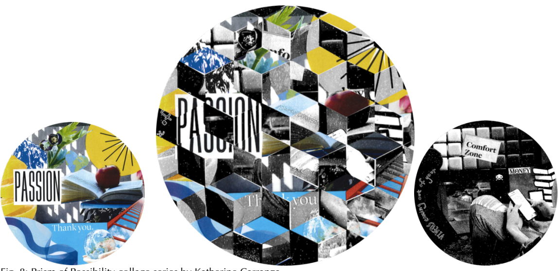
Fig. 8: Prism of Possibility collage series by Katherine Carranza

Learning can be as elementary as going up a ladder, one step at a time. From the moment we open our eyes into this world, we begin learning every day. As an educator, we must understand the individual learning process of our students and how we may scaffold their understanding to ultimately reach success.