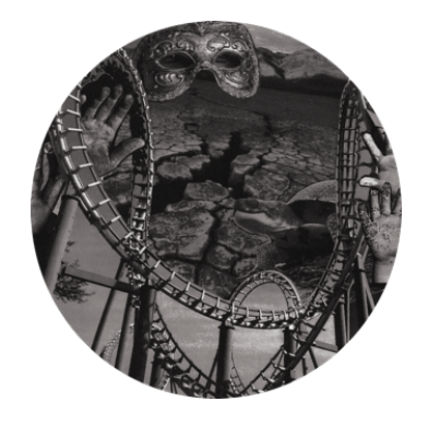
Fig. 2: Doubt collage, black and white