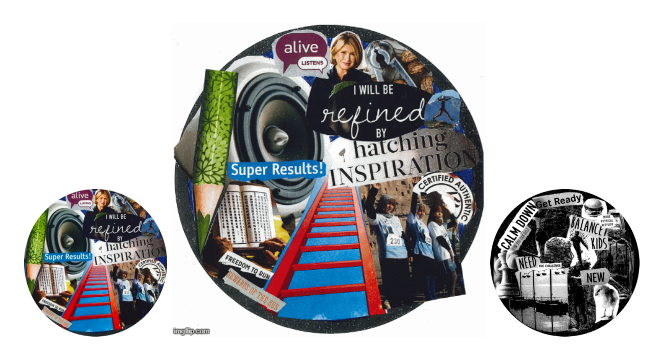
Fig. 11: From the Outside Looking In collage series by Yann Myslowski

Learning can be as easy as listening, reading, and writing, but can also be as hard as climbing a fence, hiking a mountain, or walking a tightrope. From the outside looking in, learning can be like a perfect balance of uncertainty and inspiration. As a future educator, I'm uncertain about what subjects and grade levels I will end up teaching, but I'm equally inspired by the sheer amount of learning both my students and I will be doing together along the way.