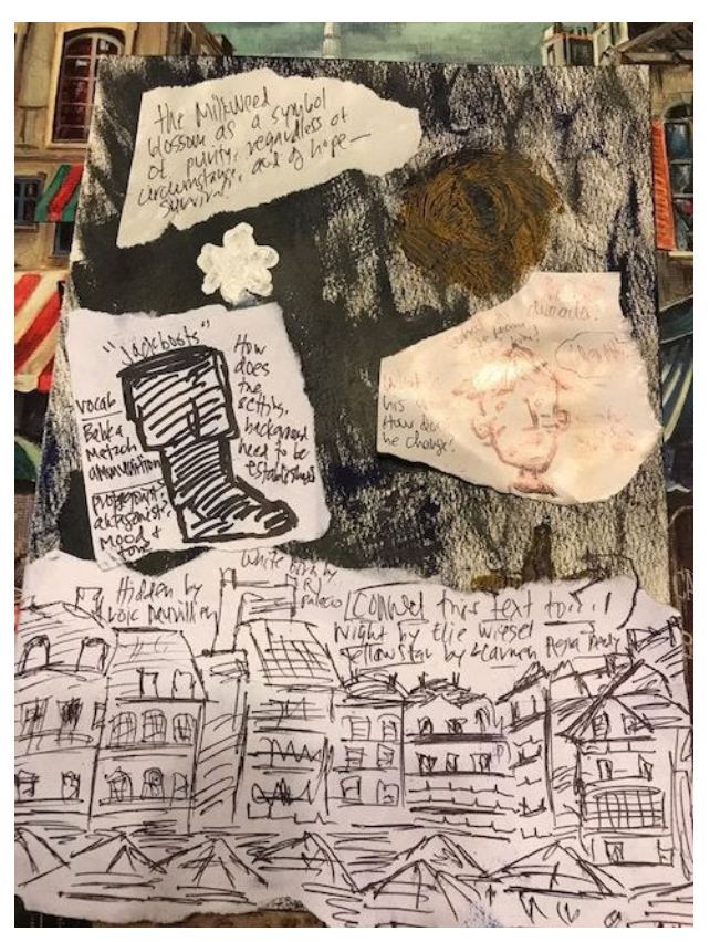
Fig. 3: Author's multimodal mentor text.

Once more, elements of the poetic nature of written response and the practice of writing with a mentor text, were traced through this work over the course of the semester. Figure 3 demonstrates the author's use of a mentor text to serve as an inspiration, rather than only a guide, for student responses. The author shared this example in the meeting prior to the due date for responses.