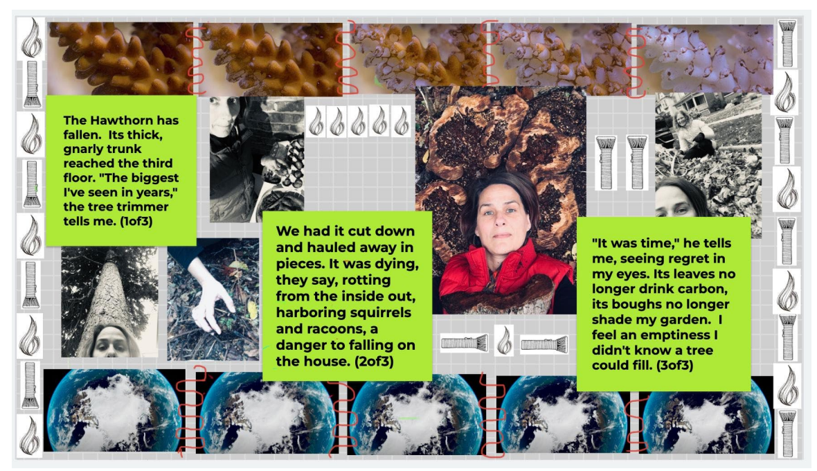
Fig. 1: The Hawthorn has fallen.

Drawing upon the collaborative potentials of shared composing spaces such as Padlet, Zoom, and Jamboard, Candance and Steve crafted a video writing prompt, combining selfie-inspired visual collage and poetry writing on issues related to the environment. Modeling this process of poetic inquiry, they composed their own selfie-collage poems and workshopped them online prior to creating their video writing prompt. See Figures 1 and 2.