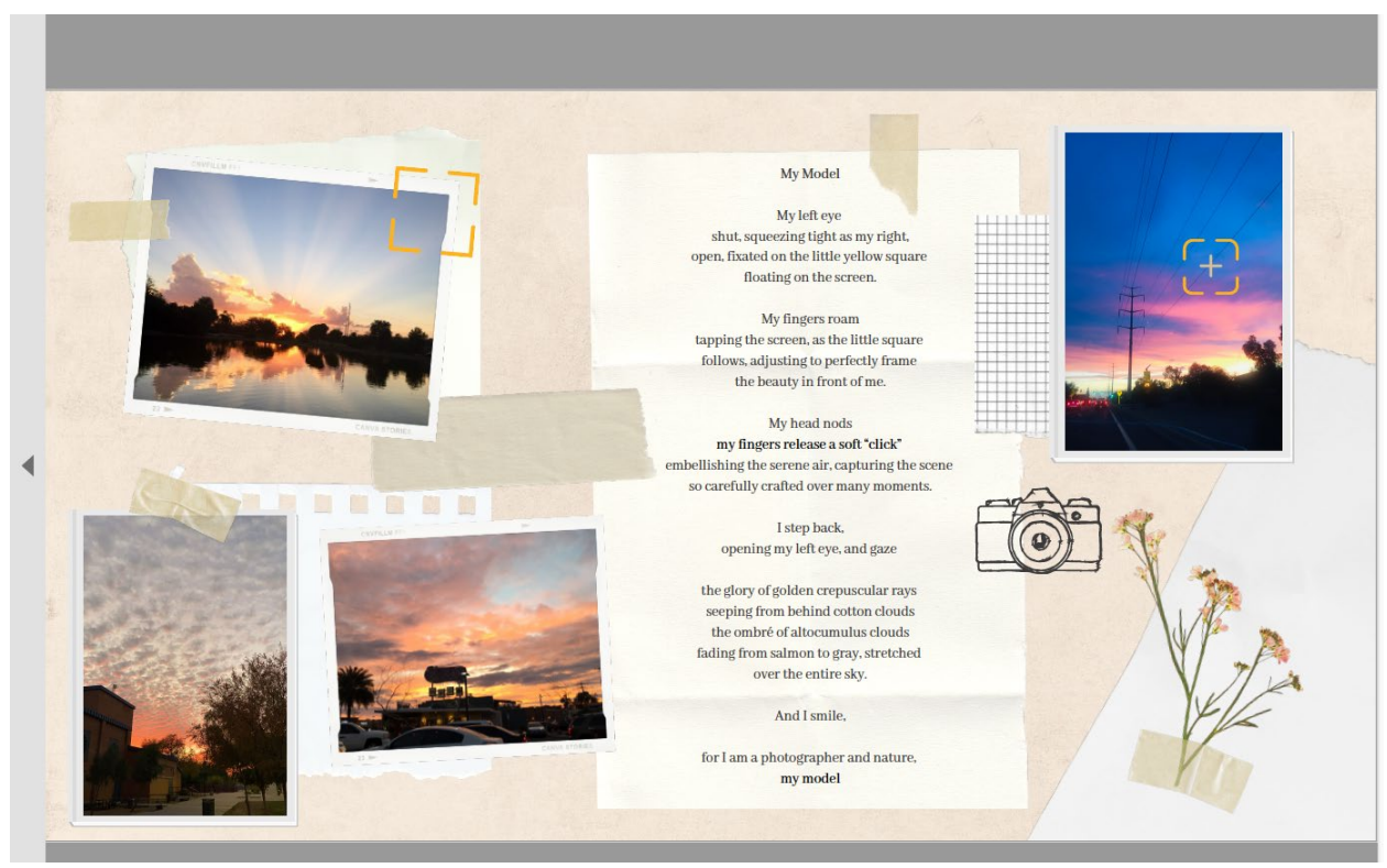
Fig. 5: Capturing the essence of nature and myself in each frame by student C.