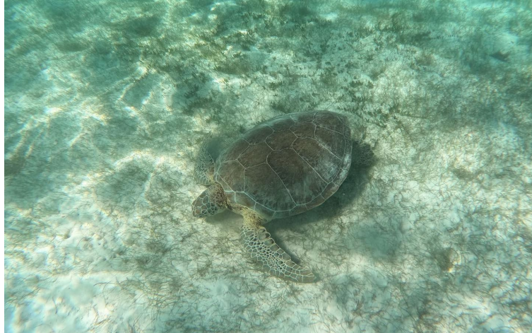
Fig. 1: Michelle's photo. "This is a photo I took in Mexico in the water. I love nature and I love to swim and take photos of nature. This was a family trip to Mexico; it made our family closer because we got to spend time together in nature."

The second week of the unit focused on fitness and mindfulness in nature. Students participated in a variety of movement activities while interacting with the natural landscape—running up a grass hill and over a bridge, balancing across a log, push-ups on some boulders, etc. The teachers then focused the last 15 minutes of each lesson on mindfulness activities where students were asked to engage with their senses while sitting silently by the creek adjacent to the school. After the first lesson, students were asked to complete the following during the week on Instagram: