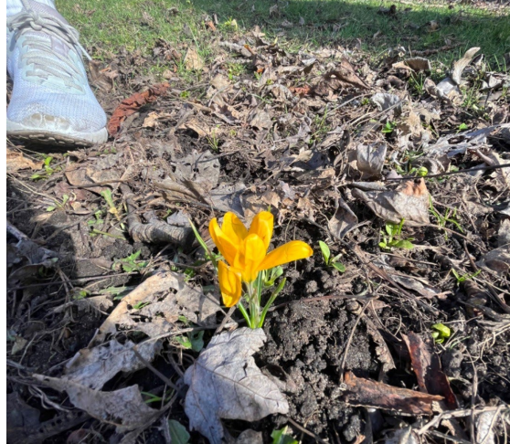
Fig. 5: Annette's photo. "During our forest games classes, some of the games we played reminded me of summer camp when I would play Camouflage and Manhunt in the forest. Then when I saw the little flower in the photo [a student] took, it reminded me of how close spring is and then from there how close summer is!! I'm so excited for the warm days coming and can't wait to be back at camp soon."

The fifth and final week of NBPA in Pictures focused on connecting to community, and yoga in nature. Each lesson, students walked to a nearby beach and participated in a variety of yoga activities, including mindfulness, as well as beach clean-ups. The Instagram prompt for this week read: "Whether it is doing yoga on the beach or picking up garbage, post a picture of yourself connecting with your community and making an impact." Often, Kate, their teacher, would also post in response to the student-teachers' prompts to serve as a model for the students (Figure 6). Nikki followed Kate's post with her own insightful thoughts on yoga at the beach (Figure 7).