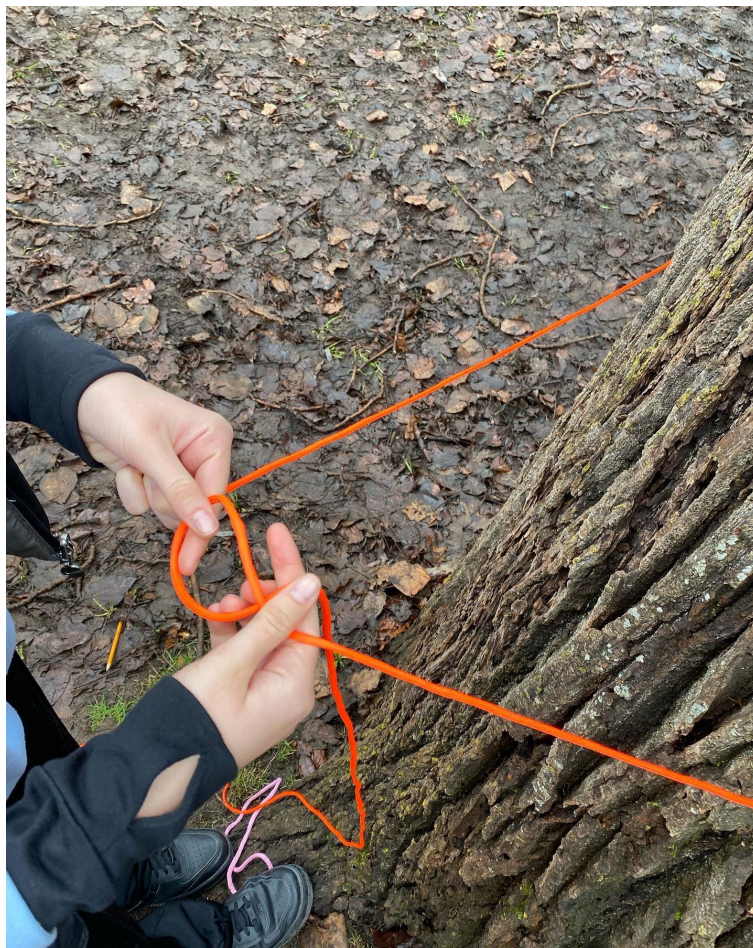
Fig. 3: Drew's photo. "We learnt some simple knot tying in class and it is an important skill to know for survival skills like putting up shelters. Another important skill we learnt was untying the knots we made. This could come in handy in many dangerous situations."

Purc-Stephenson et al. (2019), in their review of outdoor education programs in Canada, identified themes relating to the learning outcomes and psychosocial benefits of outdoor learning. The authors identified the incorporation of skills involved with recreational activities (hiking, canoeing, climbing) and camping (set-up, cooking, and fire building) to prepare students for these activities, either within the program or on their own time, as an important learning outcome. The third week of the NBPA in Pictures unit took inspiration from the results of this review and introduced students to a range of survival skills—shelter building, fire starting, and knot tying. After students had time to learn and practice the individual skills, they were asked to “select a photo taken during class that represents a practical skill you learned. In your caption, please describe what your photo is representing and when you might use that skill.” Drew posted about their experience with knot tying (Figure 3) and Sam about her fire-starting experience in class (Figure 4).