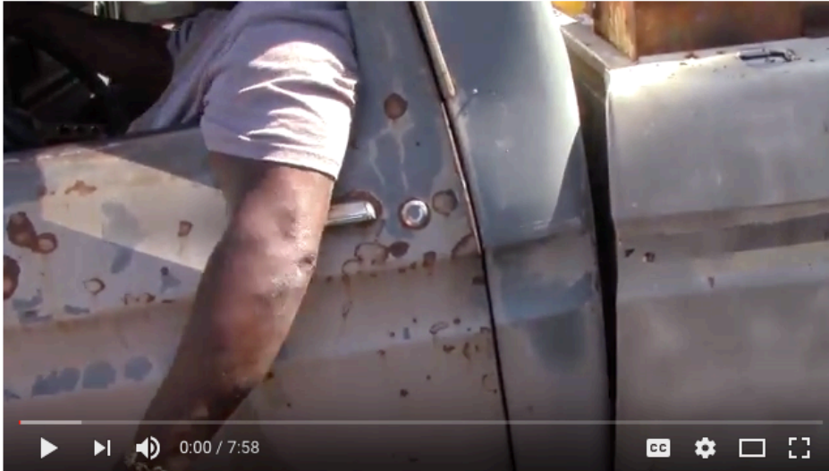
Fig. 4: F-Cubed: Interview with the Bossman [Video contribution by teen participants: https://youtu.be/g8SY4UcsnTc ]