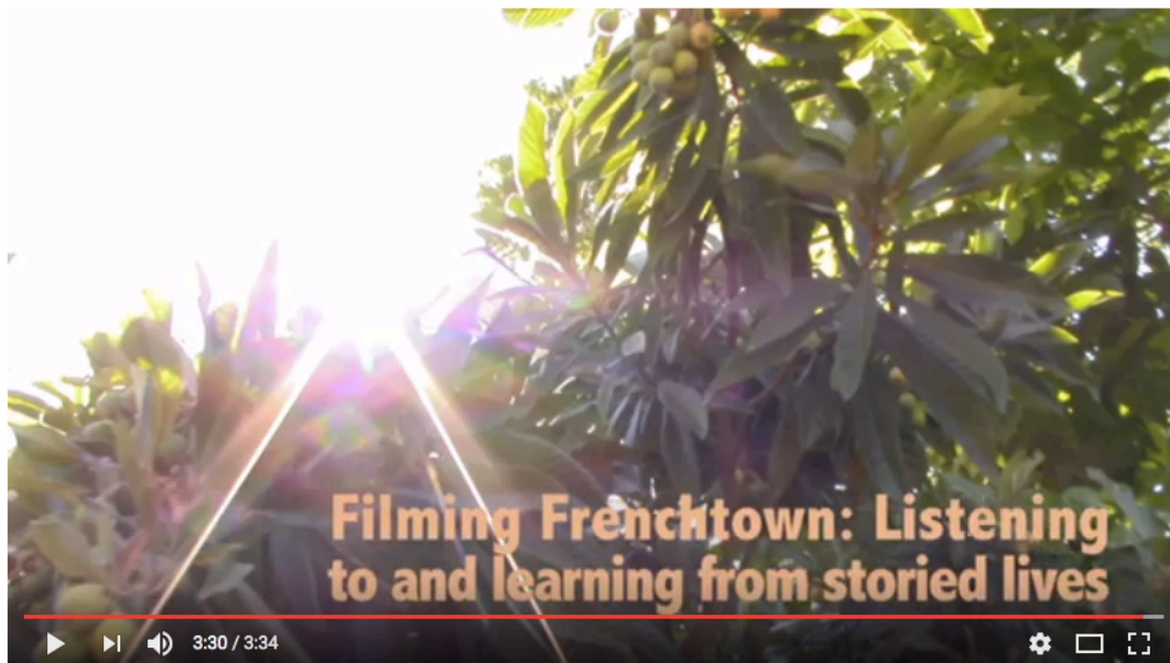
Fig. 6: Filming Frenchtown: Listening to and learning from stories lives [Video contribution edited by the authors, using teen footage: https://youtu.be/XxTTUxlvnsA ]