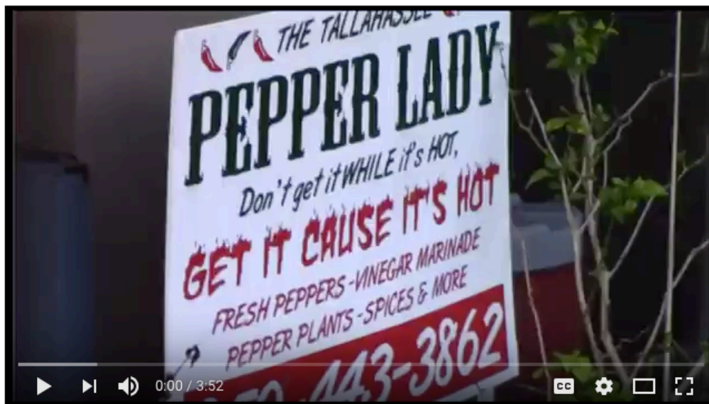
Fig. 3: F-Cubed interview with the Pepper Lady [Video contribution edited by the authors, using teen footage: https://youtu.be/onQ0Aj-MAjQ ]