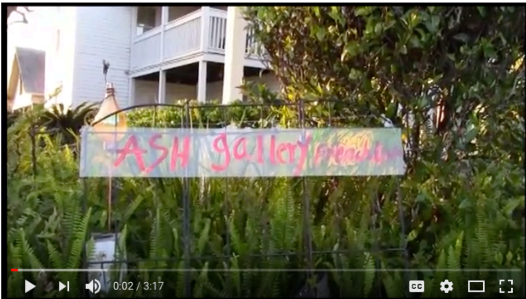
Fig. 5: F-Cubed interview with the “Art Lady” [Video contribution edited by the authors, using teen footage: https://youtu.be/eHVdqPHSB8A ]

Our meeting with the Art Lady provided a lot of background information about the history of Frenchtown, but what resonated with the teens was the experience of having met and talked with an artist. We found out during our conversation with the Art Lady that one of the teens painted and wanted to go to art school, a fact that hadn't come up previously, despite almost eight months of collaborating. Other teens also shared their own proclivities for artmaking and we lingered inside the gallery itself, a treasure trove of colorful, painted bottles, windows, canvases, and other restored objects. Hearing the story of the Art Lady created an opening for teens to share their own passions and hopes for the future. Our interview with her didn't spark an intense interest in the past, but instead connected with a desire many of the teens held on to. This encounter invited teens to imagine themselves differently, perhaps as artists, or perhaps as young people who have the capacity to mold their life into something purposeful, just as the Art Lady had.