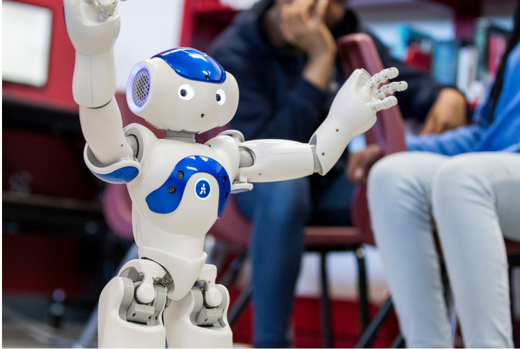
Fig. 4: The NAO robot used by Bellechasse students in their performance.