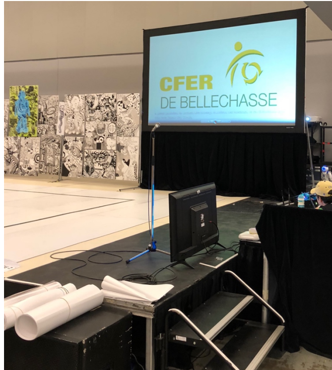
Fig. 3: The students of the Bellechasse team performed on stage with their robots, in front of a hundred spectators.

As part of the activities of the competition, CFER students had to interact with other students from around the world, which was a particularly valuable opportunity for them to be exposed to other cultures and to develop their collaborative and communication skills. For example, during the SuperTeam Challenge , the CFER team was paired with two other teams from Israel and Portugal to complete a collaborative task. The purpose of this activity was to build a robotic device that could make a work of art, live on stage.