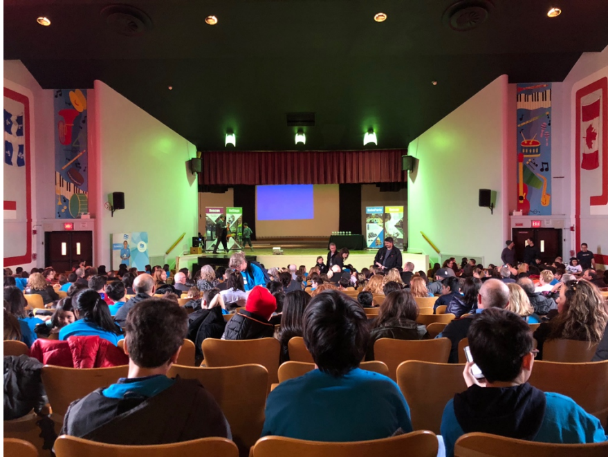
Fig. 1: Provincial qualifications for Quebec (Rosemount Technology Center, EMSB).

These Francophone students (with basic English skills) were able to compete and fully participate in the activities of this major event in which most of the participants were English speakers. They were able to count on the help of two bilingual members of the organizing committee to help them understand all the instructions given to participants. In addition to developing technological skills in programming and robotics, students mobilized their organizational, time management, and stress management skills on numerous occasions, which are critical skills for all students.