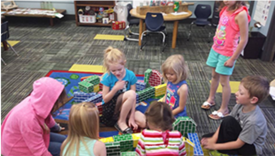
Fig. 4: A group of children negotiating configurations of the maze for the lizard.