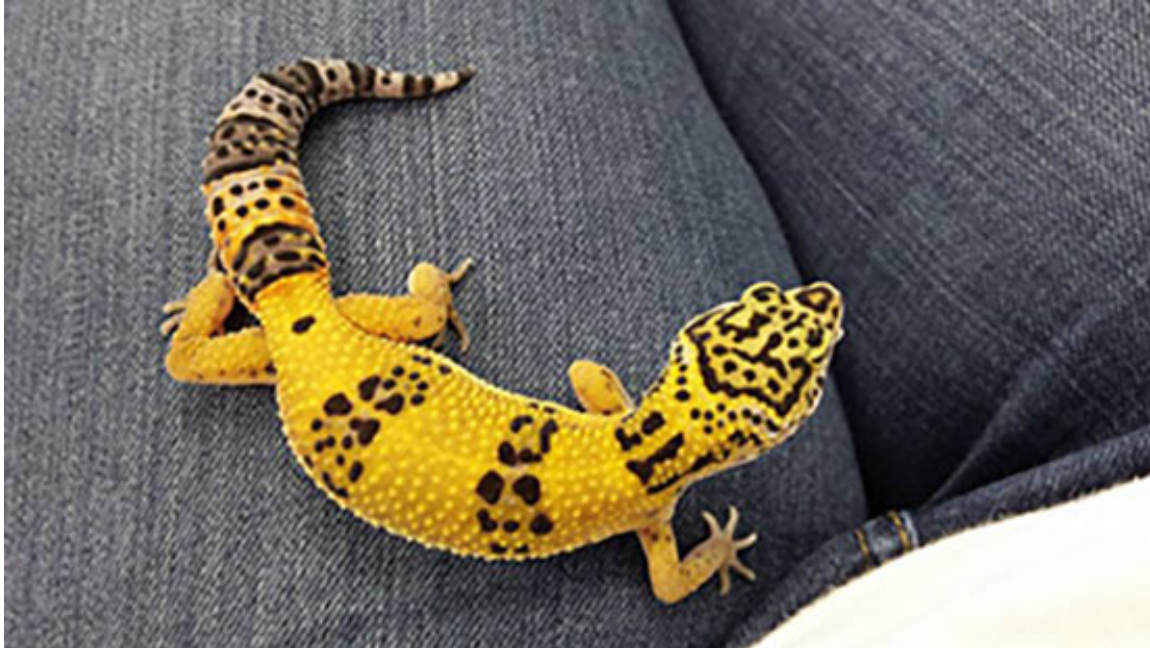
Fig. 1: The lizard, a leopard gecko, selected by the children after researching possible class pets for their kindergarten classroom.