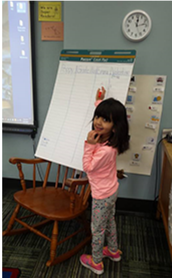
Fig. 10: The children take turns tallying the votes to determine their pet lizard’s name.