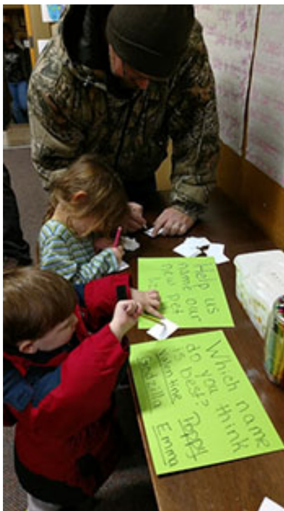
Fig. 7: The ballot box in the hallway directed the school community to vote, including listing the suggested pet names from the children. Here a kindergarten child casts a vote with her father and younger brother.

First, the class talked about possible names, generating a list of about 25 names. The class voted, narrowing the list down to four top choices: Poppy, Godzilla, Ella, and Valentine. Children discussed how to proceed, voicing that they wanted their families to be involved in making the important decision. This then turned into a discussion of inviting members of the children's "wider world" (e.g., grandparents, the entire lab school) to participate. Together, the children created a plan to engage others in the decision-making. The class set up a ballot box in the hallway outside of their classroom (see Figure 7). Children made posters inviting participation in the voting and hung them on the walls where the lab school community (e.g., other elementary students, teachers, university professors from the same university as the lab school, practicum students) could see them (see Figures 8 and 9). Children frequently invited others—children and adults—to come vote if they met them in the hall of the lab school.