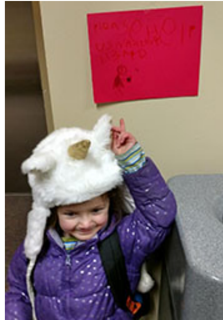
Fig. 9: A child proudly points to the sign she made to encourage the school community to participate in voting on the name of the class's pet lizard.

This sign reads, "Help find our lizard [a] name."