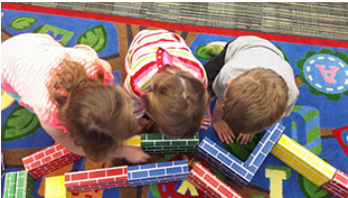
Fig. 5: The children work together to generate and test ideas about how to coax their pet lizard through the maze.