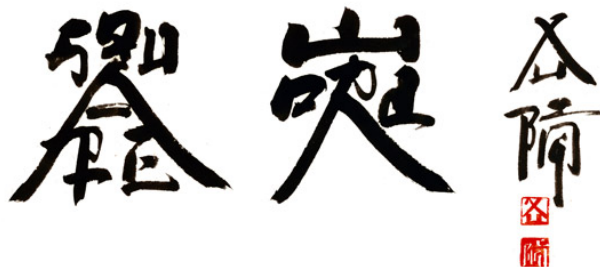
Fig. 1: Xu Bing's Square Word Calligraphy . From Asian Art Archive in America, Square Word Calligraphy , 2011, from http://www.aaa-a.org/events/xu-bing-square-word-calligraphy-classroom/

Is it possible to elevate the viewer from discomfort once meaning is understood: although the brush strokes are inspired by traditional Chinese calligraphy, Western words are actually embedded within each invented character.