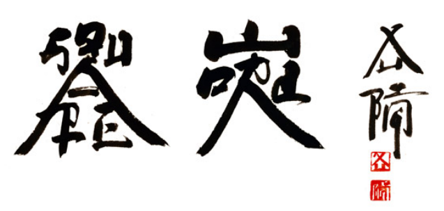
Fig. 1: Xu Bing's Square Word Calligraphy. From Asian Art Archive in America, Square Word Calligraphy, 2011, from http://www.aaa-a.org/events/xu-bing-square-word-calligraphy-classroom/

Is it possible to elevate the viewer from discomfort once meaning is understood: although the brush strokes are inspired by traditional Chinese calligraphy, Western words are actually embedded within each invented character.