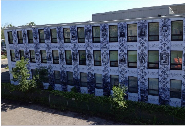
Fig. 1: Wheat paste mural

Street Art Club, which brought in local street artists to collaborate with students on a range of projects including murals and more ephemeral genres such as wheat pasting, yarn bombing, pixel art, and green graffiti.