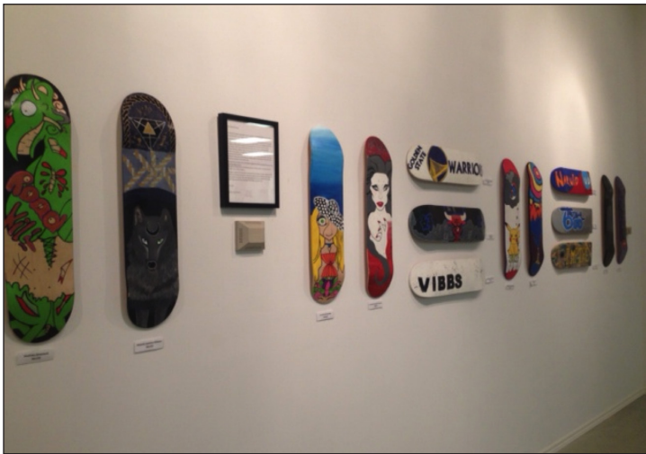
Fig. 3: Skateboard detail from gallery show

between student art curation and social engagement; the students chose to theme the first show, “The Struggle for Black Equality,” held during Black History Month, and later curated “Skateboard Matters,” featuring art works painted by students in the art class on blank skateboard decks, accompanied by a video sent to city officials lobbying for a new skate park. 4 The school also had a studio classroom that we have turned into a space for students to practise and learn street dance styles through both extracurricular and in-class dance workshops.