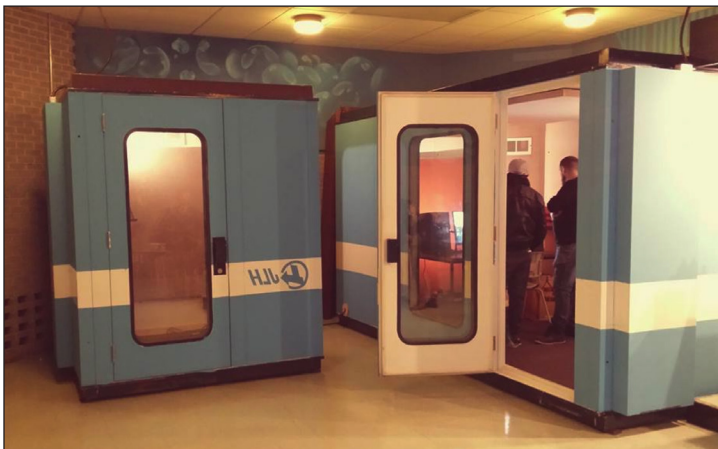
Fig. 2: JLHS recording studio

Some of the most tangible successes have been the creation of both a professional quality recording studio and a student-run art gallery. In its first few months, the studio supported projects from the music classroom and W.O.R.D. extracurricular activities, culminating in the production of a mix-tape showcasing raps and musical remixes as well as the school's new choir. The recording booths were painted by artists to look like Montreal STM metro cars.