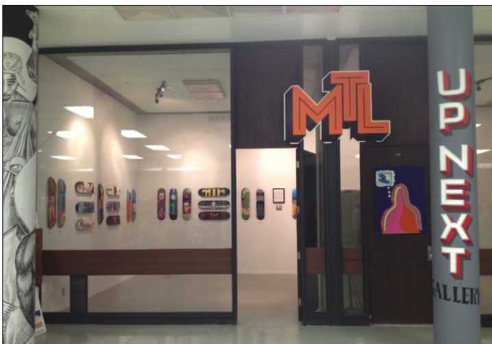
Fig. 4: UP NEXT Gallery