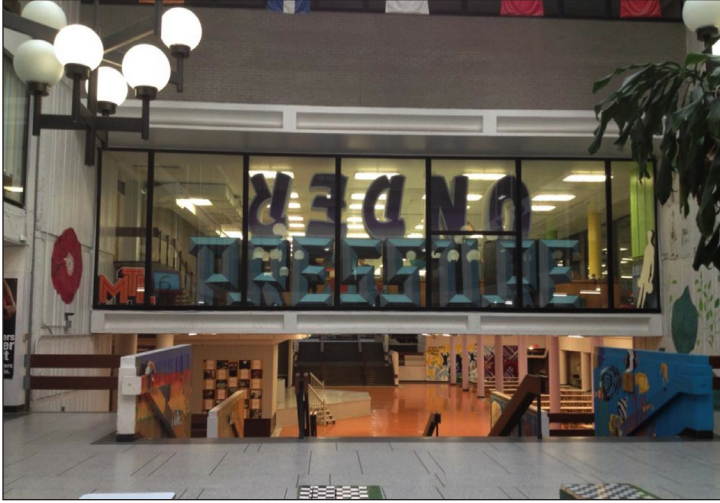
Fig. 5: Under Pressure logo in library