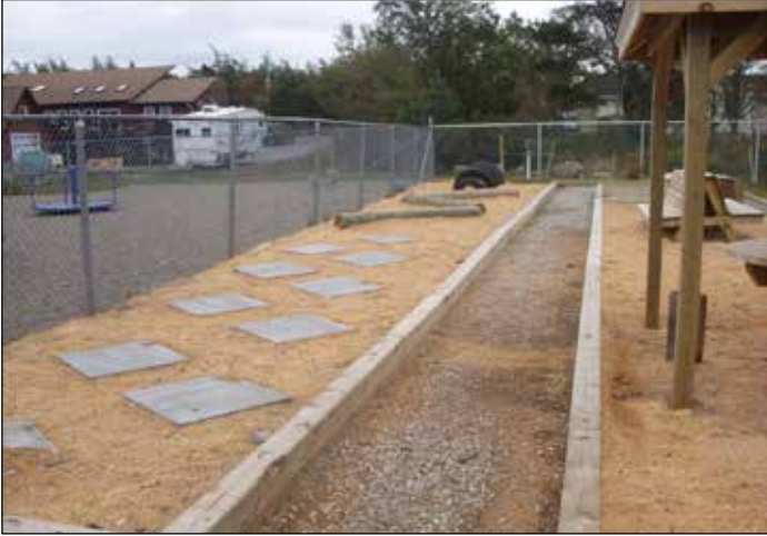
Fig. 7: New nature-based play space: interesting pathway, stepping stones, logs, and tires (Suzette's centre)