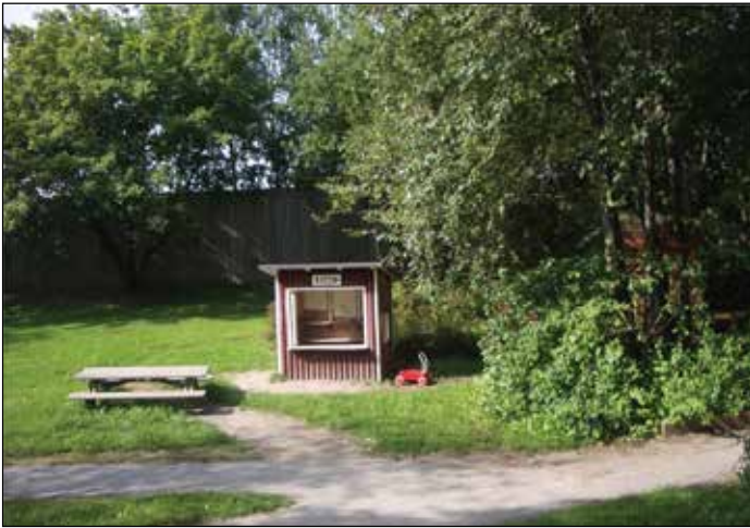
Fig. 1: Paved and grassy areas (Swedish child care centre)

childcare centres with extensive and interesting outdoor spaces. The play spaces had some paved sidewalks for the young children to ride tricycles, but there were also a lot of shrubs, trees, grass, rocks, sand pits, small gardens, and an interesting slide built into the hill (Figures 1–3). Participants viewed a brief video describing several Swedish early childhood educators' inquiry into children's use of outdoor space (OMEP, 2010). Finally, the workshop participants viewed and discussed the DVD, Leave No Child Inside (Harvest Resources, 2006), which included inspiring photos of naturalistic outdoor play spaces for young children as well as research-based information on the benefits of outdoor play.