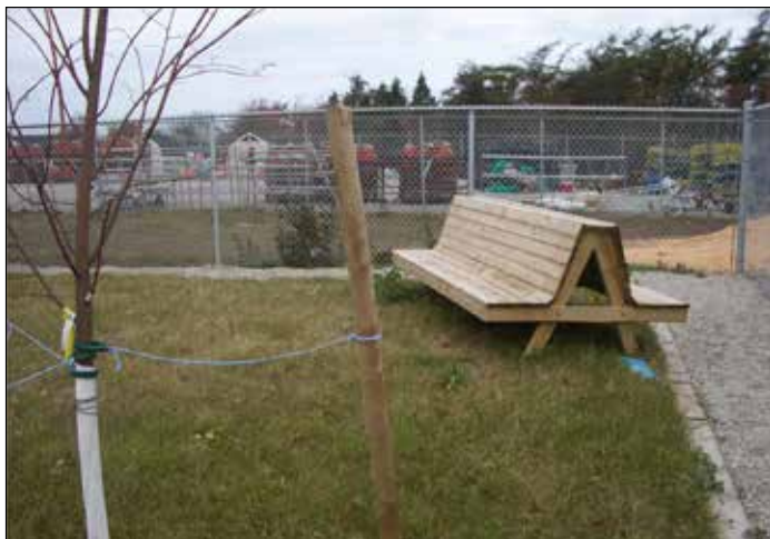
Fig. 9: Nature-based play space, with new grass and trees, and bench for the adults (or children) to sit (Suzette's centre)

The timing of the author's visit to the centre did not allow for any direct observation of the children playing outdoors, but the educators described the children's behaviour in the nature-based space as follows. "The children find things to do in there on their own. They roll down the hill, they make their own obstacle course on the stepping-stones, logs, and tires, and they like the tunnel. They play hide and seek—there are more places to hide in that space." Although the trees were small, the children were able to find leaves in the new play area for some fall crafts. The educators commented they had not been able to do that before.