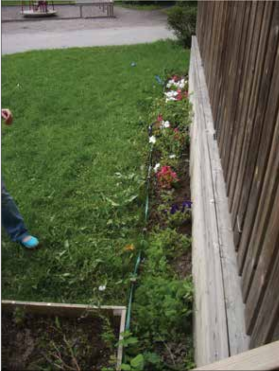
Fig. 3: Flower and vegetable garden (Swedish child care centre)

Unbeknownst to the author, that hour of viewing images and discussing nature-based play spaces had a transformational effect on the director of one community's early childhood program. The workshop was held towards the end of October. By mid-November the director, Suzette, 1 contacted the author, asking to borrow the Leave No Child Inside CD (Harvest Resources, 2006). She indicated that she was applying for a grant to build a nature-based extension to their existing play area, and she wanted to include some of the information from the CD to strengthen her application. Towards the end of November, the FNSSP coordinator and the author visited the director at her centre and learned more about her plans.