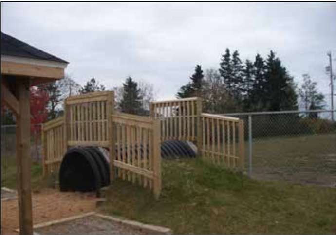
Fig. 8: Nature-based play space, tunnel, and bridge (with railings) at Suzette's centre