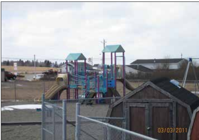
Fig. 4: Commercial play structure on gravel surface (Suzette’s centre)

“When most adults were children, playgrounds were asphalt areas with manufactured, fixed playground equipment such as swings, jungle gyms and slides, where they went for recess. Therefore, most adults see this as the appropriate model for a playground” (p. 1). This seemed to be partially the case for Suzette. Her previous decisions about playground equipment were to purchase commercial structures. But, she reported that her own fondest childhood memories were of messing around outside in natural spaces. The images shown during the workshop brought those memories back to her and introduced her to ways to incorporate elements of nature in outdoor play spaces for young children.