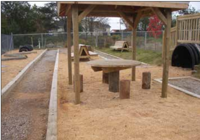
Fig. 6: New nature-based play space: covered gazebo for children and adults (Suzette's centre)

The author visited the community early in October, almost exactly a year after the workshop, to see the new play area (Figures 6–9) and to hear from the educators how the space was being used. When asked what she thought of the new space, one educator commented, “It’s nice to look at, pleasing on the eye. It’s an extra place to play. It’s nice to have grass instead of rocks.” Another educator added, “I like the gazebo and chairs; the children can sit in the shade. It would be nice to have a tea party out there.” The educators described the new space as “peaceful and relaxing” and mentioned that the benches for the adults to sit were a welcome addition.