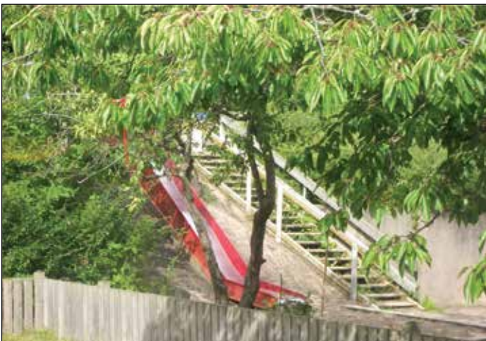
Fig. 2: Slide and stairs built into the hill (Swedish child care centre)