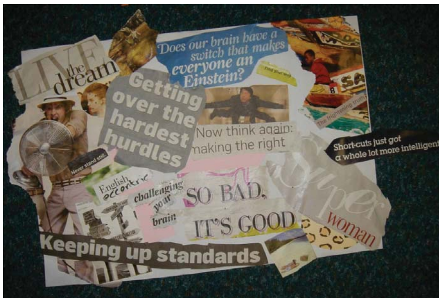
Fig. 3: Collage-making

These resources included image-based activities to stimulate discussion, and collections of images for storytelling and theme-based reading and writing tasks. Responses to these activities suggested their usefulness for practice: illustrative examples of positive responses were that they: "Provided great ideas" and "It really helped me in my teaching practice."