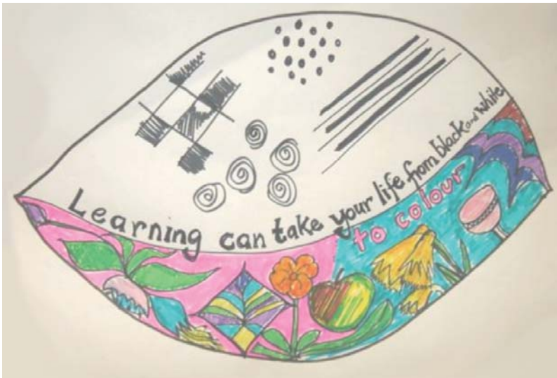
Fig. 1: Using arts-based approaches: results and reflections

methods. It builds on Poincaré's notion of creativity as a series of phases of preparation, incubation, illumination and verification (Balzac, 2006). Creative reflection comprises the stages of preparation, play, exploration and synthesis, and includes individual and group activities such as creative thinking exercises, playing games, drama, creative writing, and art-making. The preparation stage acknowledges the uncertainties of the creative process and provides "threshold activities" (Tracey, 2007) to support engagement. These activities do not require participants to generate creative artifacts, but to respond to existing images. The second stage, play, offers opportunities to explore ideas in an unthreatening environment. Typical activities include creative thinking exercises and the creation of acrostic poems and collage-making. The third stage requires a more deliberative exploration of ideas, whereby individuals and groups design and produce artifacts such as films, poems, artwork, pieces of music and dramas. The final stage, synthesis, involves individual and group reflection on the processes of learning and meaning-making and on applications to students' practice.