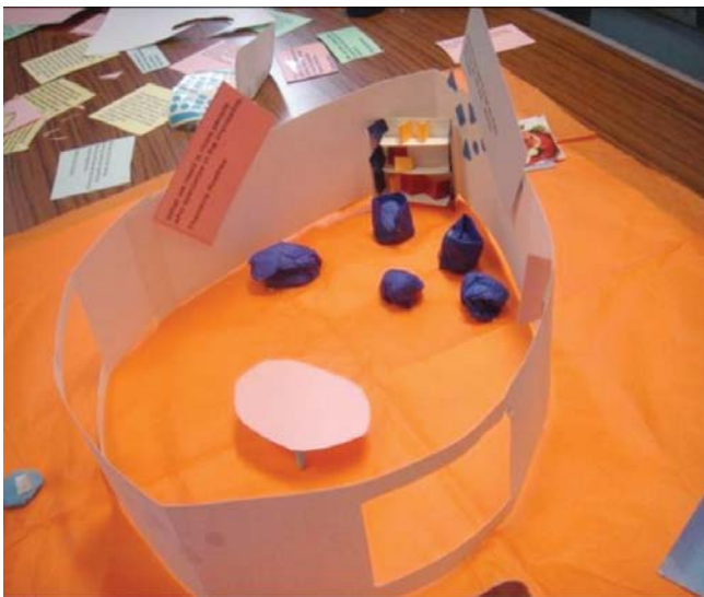
Fig. 4: Using art materials to reflect on course themes

This comment indicates the potential for the development of self-awareness and confidence for literacy learners through the process of collage-making; it also demonstrates the significant role which the tutor plays in facilitating such a process. As a multidimensional form of meaning-making that juxtaposes image and text, collage provides opportunities to identify new understandings of the relationships between word meanings and visual symbols and how the individual learner relates to these; it thus provides a process for crossing thresholds into expanding conceptual spaces.