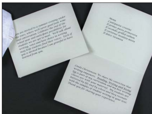
Fig. 4: Invitation and menu