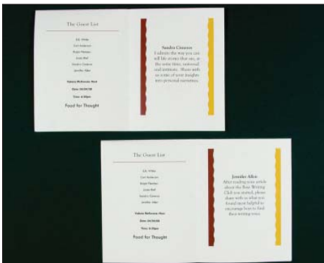
Fig. 3: The guest list