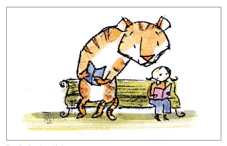
Fig. 2: Reading time with tiger

and pedaling enthusiastically on imaginary bicycles alongside their favorite book character during storytelling time. Quite a sight!) In my opinion, if they are introduced early in any such way to books or stories they are likely to enjoy, they stand a better chance to be interested in reading altogether.