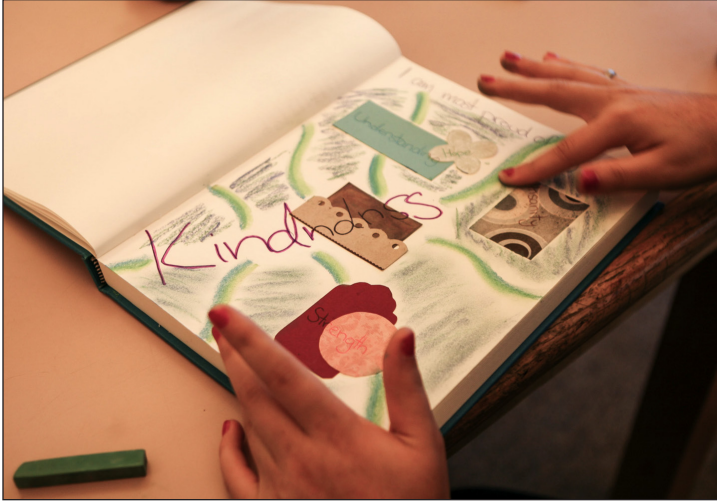
Fig. 3: A writer's collage

On one particular Thursday, one of the writers suggested we tell a story orally as a group. As we spoke around the circle, each of us added our piece to the story: