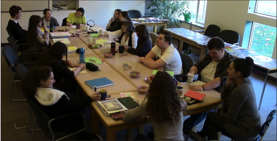
Fig. 1: A safe, playful, and non-judgmental space

Through engaging in the four practices of Writing Freely, Reading Aloud, Listening Deeply, and Bearing Witness, the writers co-create a safe, playful, non-judgmental space in which they can relax and open to their creativity. Returning to this simple structure, again and again, the writers explore their passions, make meaning of their experiences, and grapple with the daily challenges of their lives.