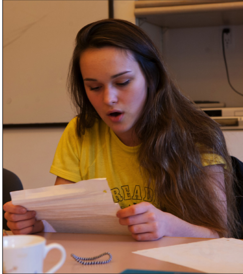
Fig. 2: The pleasure of reading