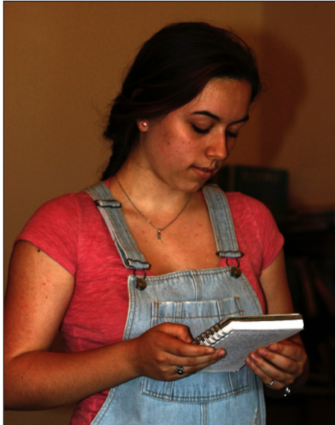
Fig. 4: Spontaneity at work

When asked to share some words to describe how this spontaneity happens, the writers offered: We “create, connect, turn weakness into strength, unknowing into possibility, risk, show up, care, try, eat, laugh, hold the silence, feel the thoughts, and experiment. It’s a part of the space we create.”