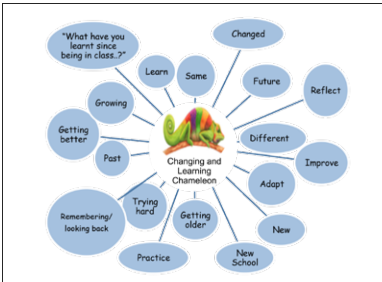
Fig. 2: Mind map for changing and learning

The Language for Learning project exemplifies what happened when one inspired headteacher sought to adapt the ideas for use within her early years setting. Following a successful pilot by one of its teachers, the Language for Learning project was rolled out across the nursery school. A whole-school approach and ongoing professional development work with the staff in how to use the language was crucial to its success, and it gradually became embedded across the curriculum in every class. Learning as they went along, staff captured words and phrases they heard children use and developed language mind maps for each of the animals/learning dimensions. Figure 2 demonstrates the mind map generated for Changing & Learning.