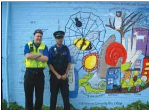
Fig. 4: Two community policy officers standing in front of the children’s mural

There was considerable local interest in what was happening as school staff, parents, and children gathered one summer’s evening to begin making the mural. Local adults and young people wanted to know what was going on and how they could help. In the end, local residents, family and friends, together with a number of young people, worked together to get the outline onto the wall. The next day the painting of the mural started. To begin with, the parents were unsure about the children being involved in painting the mural because they thought they were too young and would mess it up, but the school staff reminded them that it was their mural as well. Anti-graffiti paint was put over the top, but the mural has not been defaced. The local press were invited and the community proudly celebrated what had been achieved.