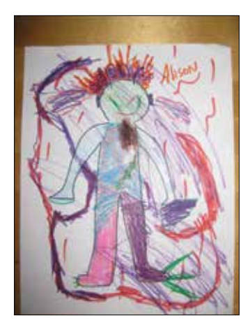
Fig. 1: Collaborative drawing

Alison arrived for each visit with a craft bag, stocked with slightly different things, but always copies of a paper with the outline of a person on it. The idea was to ask the children to colour in the person, using a different colour pen for each language they speak, and that this would be a nice way to elicit conversations about their understandings of their multilingualism. In practice, this never happened, but the collaborative drawing Henry (age 6), Elizabeth (age 4), and Alison did on the person outline ended up creating the conditions for a very rich conversation about their language practices. The drawing became very multi-layered; as they drew, a co-created story emerged.