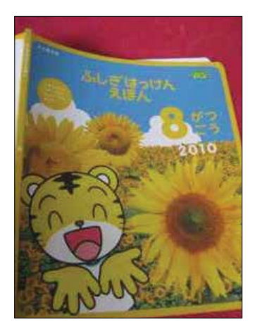
Fig. 3: Fushigi Hakken Ehon

Totoro picked a Japanese book to read. Fushigi Hakken Ehon is a picture book about two types of insects.