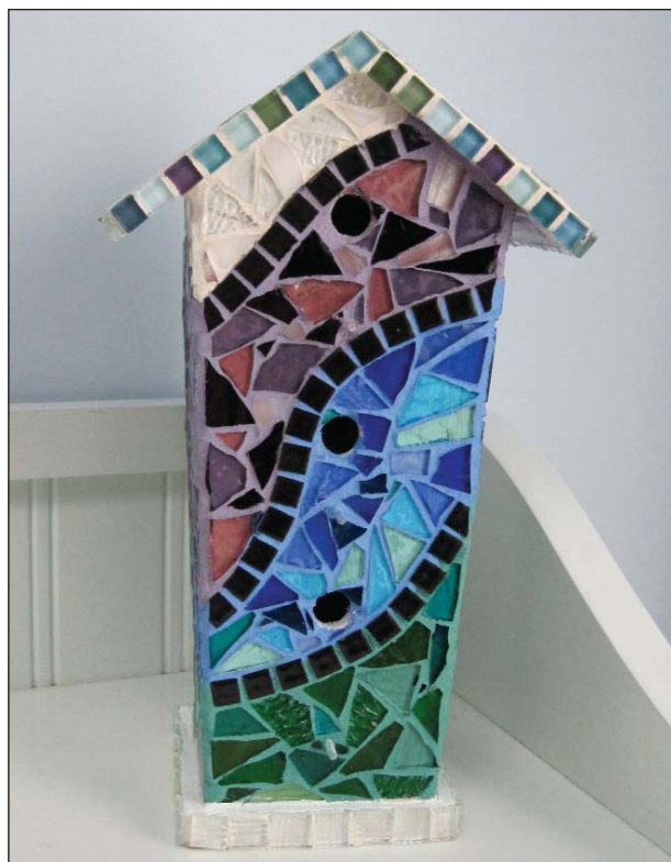
Fig. 1: My mosaic birdhouse

And so, in the end, the road to inquiry remains muddy. Such is the nature of the process. While teachers can define goals, in particular, articulating when there is a “right answer” to be identified and when there is not, in the end, the role of the teacher is not to take the mud out of the road, but to help students develop the skills to make the journey. We start to do this by knowing, ourselves, the kind of journey that lies ahead—is today’s jaunt a direct route aiming at a particular peak above, or could it be a meandering trail leading to multiple goals? We prepare students with the skills needed for the journey, and the emotional support to continue when things get rough. And finally, we commit to clear and honest feedback that will help them stay on a successful path. I have learned how exciting it can be to manage a journey I thought was beyond me. May your students share my delight!