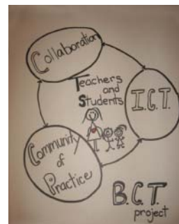
Fig. 1: Key elements in the BCT project