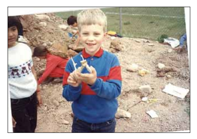
Fig. 12: Specimen discovery at paleontological expedition