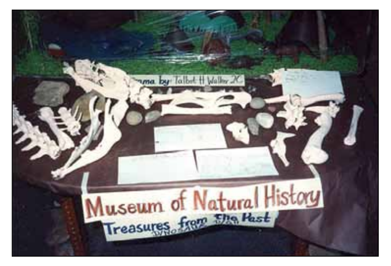
Fig. 14: Museum exhibition of paleontological findings