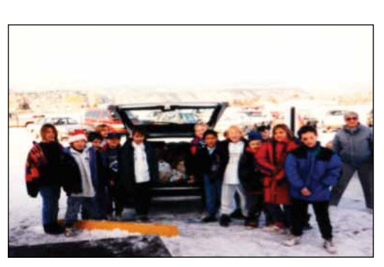
Fig. 16: The great donation estimation challenge canned food delivery