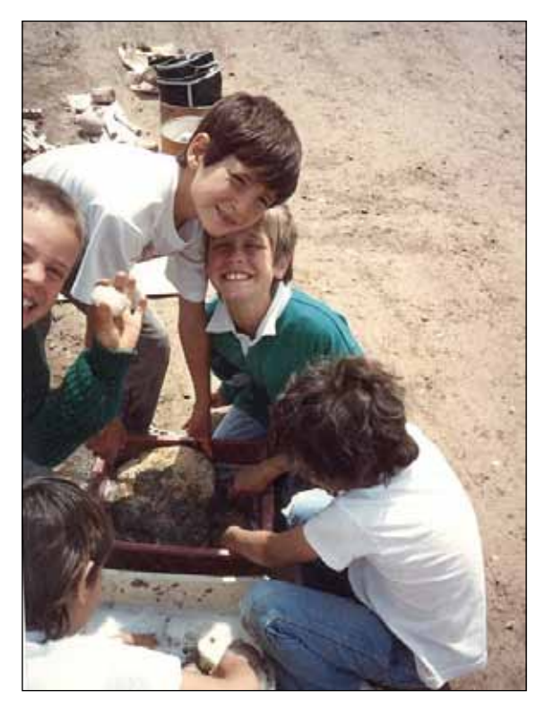
Fig. 13: Preparation of artifacts for transportation to the lab