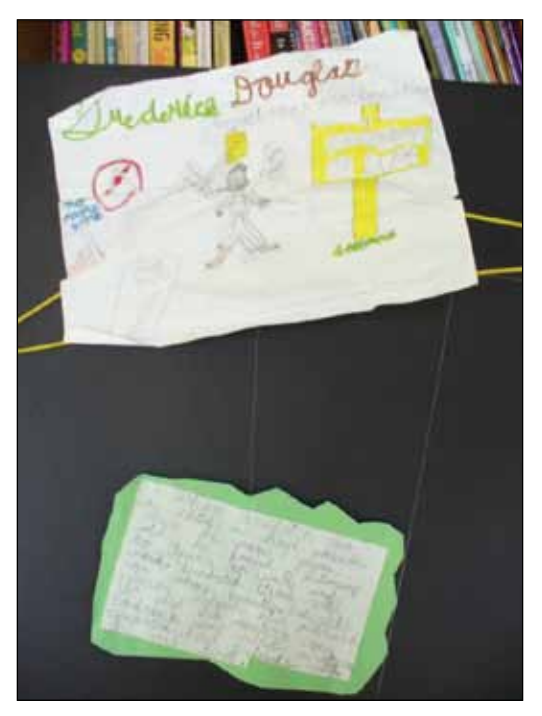
Fig. 9: Frederick Douglas biography book mobile

Similarly, the chronological segments of a book mobile can be used to relate specific periods in the biography of important historical figures like Frederick Douglas (see Fig. 9).