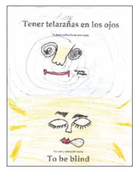
Fig. 3: Dual language idiom posters