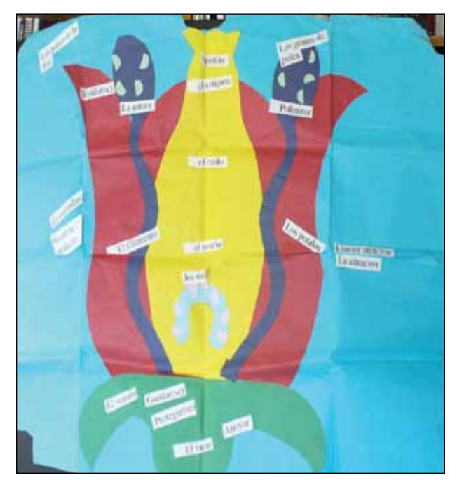
Fig. 7: La Tablas de las partes de la flor / Parts of the flower chart

Innovative teachers can construct imaginative connections between themselves, their students, and the curriculum by honoring and employing students' cognitive pluralism. For instance, third graders might precisely label the parts of a flower on a giant chart in their native or second language only to act out the respective structural functions in a dance to Aaron Copeland's "Flight of the Bumblebee" (see Fig. 7).