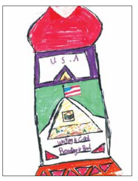
Fig. 4: Design proposal for Flying Literature Mobile (FLM)

In the larger literature on creative classrooms, the focus lies on the individual teacher or student. However, in CHACE, practitioners can adopt a culturally relevant, curricular framework to systematically and imaginatively scaffold learning experiences for their entire class. For example, at the start of the school year when teaching in separate fourth and fifth grade Dual Immersion classrooms, we adopted the metaphor of learning as an adventurous journey. The language-literacy arts were presented as the vehicle by which the children might realize their dreams. A design competition was held for students to propose what a class aircraft might look like; the children worked as individuals, pairs, or in small groups to illustrate their conception of a Flying Literature Mobile (FLM) (see Fig. 4).