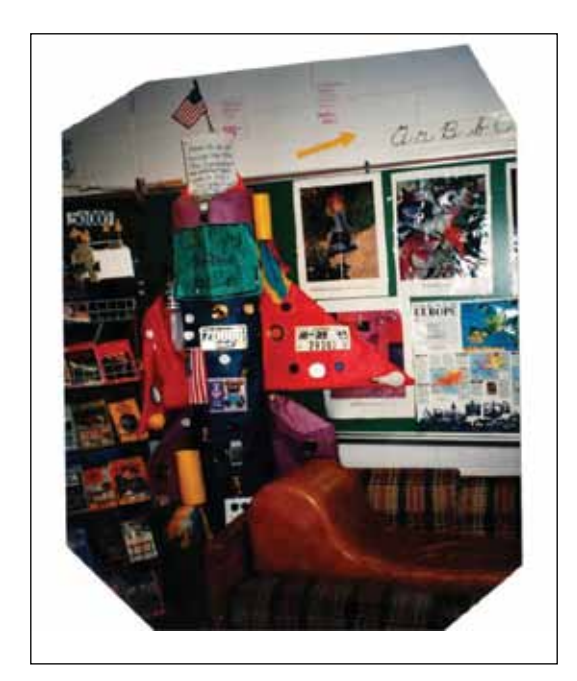
Fig. 5: Flying Literature Mobile (FLM)

A daily class narrative was constructed around these adventures. Each morning, students pounded on the door to read informative communications from the FLM's control center that alluded to, challenged, or targeted specific literacy, numeracy, and content knowledge, skills, strategies, and dispositions. The example in Figure 6 foreshadows the study and application of geographical concepts of latitude and longitudinal lines.