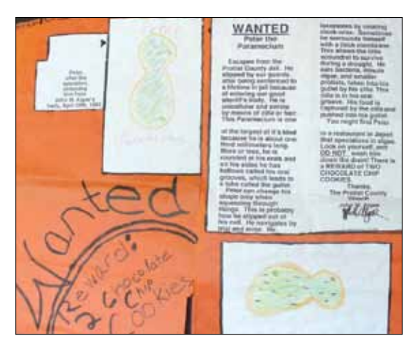
Fig. 11: Wanted poster for Peter the paramecium

Once children are invited to engage in these imaginative ventures, they will construct their own innovative artifacts to reflect curricular knowledge and competencies. Figure 11 displays a wanted poster for Peter the Paramecium composed by two fifth graders after reading about unicellular protozoa in their science text. The artifact includes two mug shots, a detailed description of the criminal, grounds for his arrest, and a reward for his capture, written and fictitiously signed by the Protist County Sheriff. With the exception of identifying general grading criteria with their teacher, the entire project was devised by the two girls.