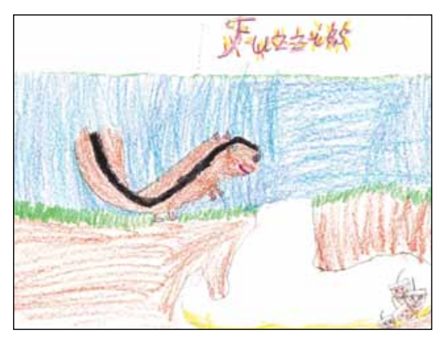
Fig. 8: Seed dispersal drawing – fuzzies

Similarly, the chronological segments of a book mobile can be used to relate specific periods in the biography of important historical figures like Frederick Douglas (see Fig. 9).