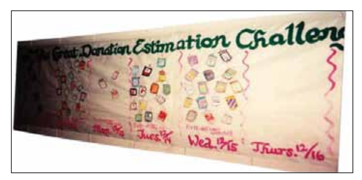
Fig. 15: The great donation estimation challenge graph

Finally, CHACE classrooms extend Vygotsky's notion that emotion fuels all human endeavors including scientific discovery, sports, and work for the welfare of others. Social justice projects can similarly provide motivating projects where children appropriate and refine knowledge, skills, strategies, and dispositions while becoming agents of change. For example, our second graders collected a sufficient number of aluminum cans to purchase an acre of rain forest for protection by a conservation group. Fourth graders completed an investigation on nutrition, food, and hunger by sponsoring a school-wide, canned food drive called the Great Donation Estimation Challenge, showcasing their proficiencies in the use of graphs, multiplication, and percentages (see Fig. 15 and Fig. 16). Fifth-grade emergent biliterates decided the best way they could combat youth drug use was to donate Spanish-English recordings of their favorite pieces of children's literature for check-out at the local library. By targeting constructive solutions, children can actualize the old axiom that "knowledge is power." In realizing their dreams, students learn to locate themselves and others in positions of empowerment.