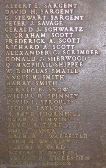
Fig. 5: The above are close-ups of two of the five panels of names on the Westmount High School memorial. Each individual listed has an individual story to tell that includes school days at Westmount.