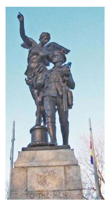
Fig. 4: The Westmount, QC Cenotaph (WW1 & WW2) across from the Town Hall