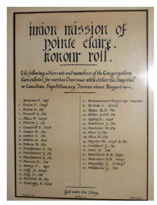
Fig. 3: Honour Roll WW1 Cedar Park United Church, Pointe Claire, Quebec.